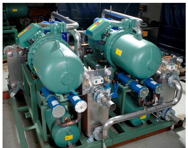
The HP-unit supplied to Sahalahti.